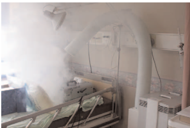
Testing the IQAir® in location. Artificial smoke is generated on a hospital bed and then captured at source with the help of the IQAir® FlexVac™'s flexible suction arm.

Thanks to the professional effort of a Hong Kong based authorised IQAir® dealership and IQAir®'s previous experience in the field of hospital infection control (see IQAir® press release "Decentralised Airborne Infection Control in Health-Care Facilities"), IQAir® was able to develop a tailor-made SARS control solution for the hospitals managed by the HKHA.