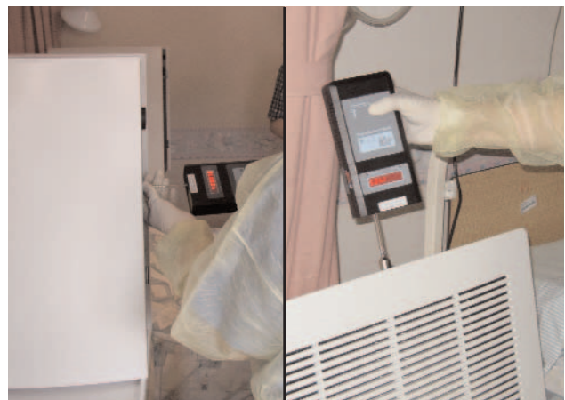
A Senior Engineer of the EMSD assesses the actual filtration efficiency of two air cleaners with a laser particle counter. The majority of conventional air cleaners failed the efficiency test.

In order to find the most efficient, reliable, flexible and cost effective solution, the Electrical and Mechanical Services Department (EMSD) of the Hong Kong Government performed rigorous tests on behalf of the HKHA. They evaluated the suitability and performance of many filtration systems, including IQAir®. With the help of a laser particle counter the EMSD tested the actual filtration efficiency of each filtration system.