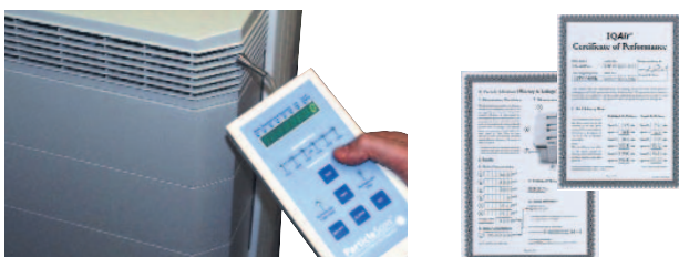
Each IQAir® HEPA filter system is individually tested for filtration efficiency and air delivery. The actual test results are documented on a numbered test certificate.

The efficiency tests quickly revealed that most of the air cleaners failed to remove airborne particulates with the required actual efficiency in excess of 99.97% for particles of 0.3 µm and larger. With its certified and independently type-tested filtration efficiency IQAir® passed this test. After the preliminary selection process, it was the EMSD's aim to select an infection control system that could be put into action in a matter of minutes and that would be able to effectively limit the threat of airborne disease transmission from a SARS patient to health-care workers by providing reliable and certified actual filtration performance.