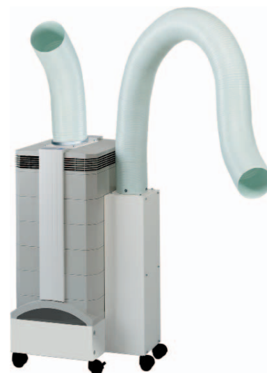
The customised IQAir® filtration solution for the Hong Kong Hospital Authority combines an IQAir® filtration system with the FlexVac™ source capture kit and special flexible OutFlow™.

filtration process. At the final filtration stage IQAir®'s independently type-tested HyperHEPA® filter removes even the tiniest of airborne microorganisms, including the SARS virus, with an efficiency in excess of 99.5%. As a result the risk of infection within the patient's room can be greatly reduced, thus providing a safer working environment for health-care personnel and limiting the risk of spreading the disease.