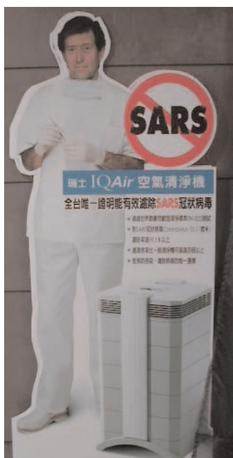
Taiwanese IQAir® display.

It is clear that vigilance for SARS must be maintained, because resurgence of the virus is possible. As a world leading manufacturer of mobile air cleaning systems IQAir® feel honoured and privileged to be able to play an important part in providing professional air cleaning solutions for the fight against SARS and other airborne infection control challenges.